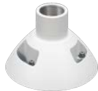
WV-QSR504F-W Mount Bracket