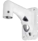
WV-QWL501-W Mount Bracket