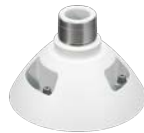
WV-QSR504M-W Mount Bracket