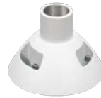
WV-QSR504F1-W Mount Bracket