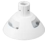
WV-QSR504-W Mount Bracket